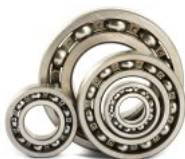
Spare parts books and structures