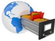
Connections to CAD software