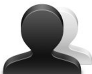
Centralized user management