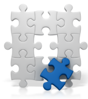
Other expansion options