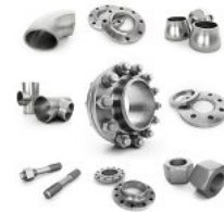
Items and product structures